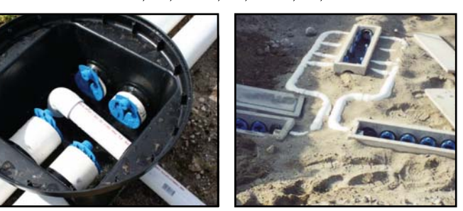
Custom Distribution Boxes with Equalizers installed

PATENTS: U.S.A. - 5,680,989 - 5,154,353 - 5,107,892